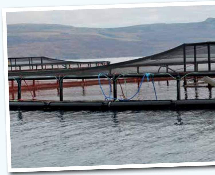
Atlantic salmon sea cage farming.

HOW: Individual fish are scored (ideally at time of sea lice monitoring) by checking dorsal, caudal and pectoral fins. 1: most of fin remaining; 2: only half of fin remaining; 3: very little of fin remaining.