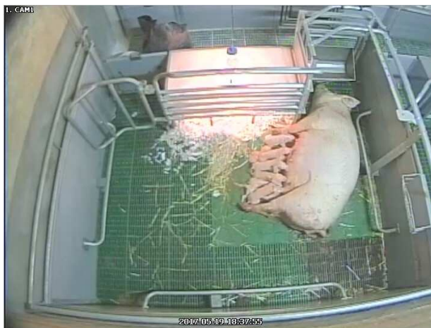
Figure 3 - Piglets with sow in Fumagalli's free farrowing systems

Piglets have access to a heated creep area which is easily accessible from the corridors to ease farmer management (Figure 3); paper bedding is provided in the creep area at the time of farrowing, as paper has shown to be better in drying piglets off immediately after birth. During lactation, piglets have free access to water and ropes, which can provide further enrichment as they can be chewed and bitten by the animals.