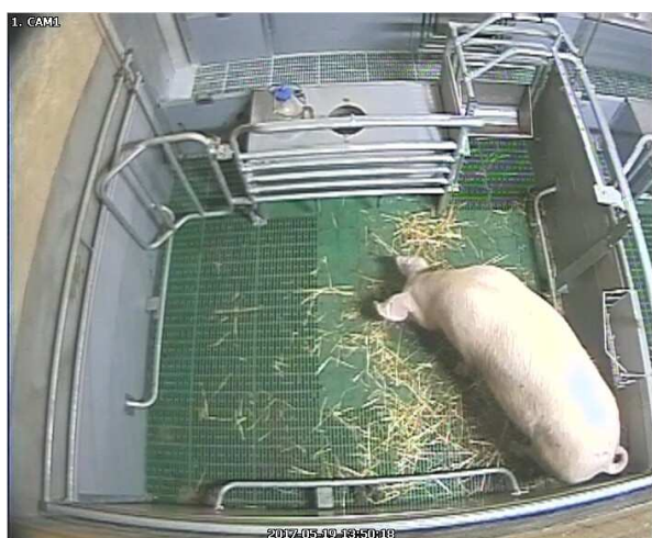
Figure 2 - Sow performing nesting behaviour using straw

Each pen has 50% solid floor (part in the creep area and part in the pen to guarantee comfort to the sow) and 50% slatted floor. The floor is made of plastic square tiles which can be moved and re-arranged to identify the part of the pen where the solid floor works better for the sow and piglets (Figures 2 and 3). For example, if the solid floor gets wet, it may get slippery, increasing the risk of the sow laying down abruptly and crushing the piglets. The risk of crushing is reduced by the presence of farrowing bars in the lower part of the pen walls, which encourages the sow to lie down more slowly.